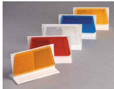
Available in standard colors: AMBER, RED, CLEAR, BLUE.