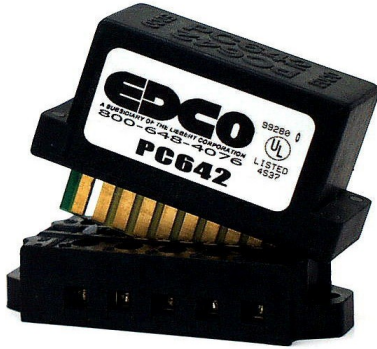
EDCO PCB1B BASE SOLD SEPARATELY

The PC642 Series surge suppressor is a dual pair (four wire) module implementing three-stage hybrid technology. This module addresses over voltage transients with gas tubes and silicon avalanche components. In addition, sneak and fault currents are mitigated with resettable fuses (PTCs). The PTCs increase resistance several orders of magnitude when over currents exceed safe levels. A normal state resumes when over currents are removed. The ability to self restore in this manner significantly increases suppressor performance and survivability.