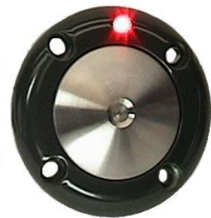
4 EVR Enlightened PPB Rnd