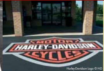
Harley-Davidson Logo © HD