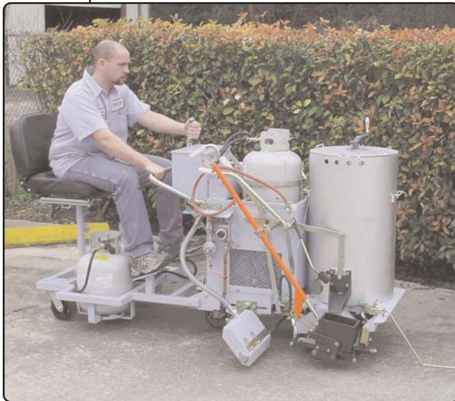
Shown with optional riding operator's sulky.