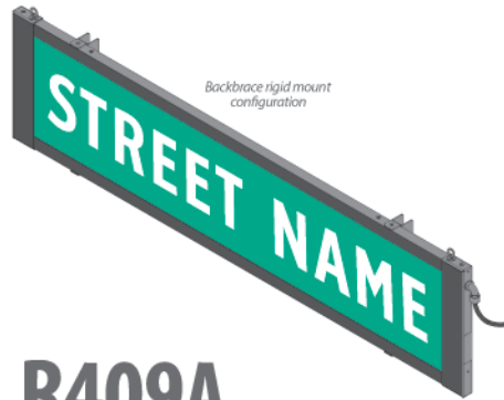
Backbrace rigid mount configuration

90% ENERGY SAVINGS over traditional fluorescent signs, and no bulbs or ballasts to replace!